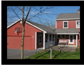
View from the street

The office is the last house on the right (#23- a red house with white trim)